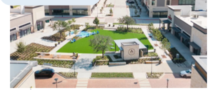
RETAIL – $7M