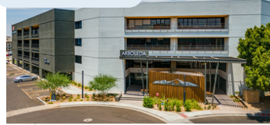
OFFICE – $32M