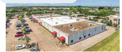
INDUSTRIAL – $26M