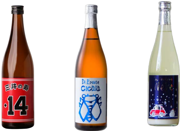
Mii no Kotobuki