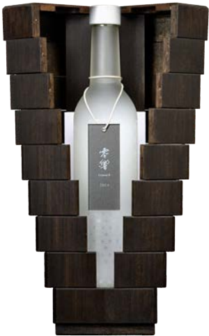
Reikyo -Crystal 0-