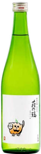
Hagi No Tsuru