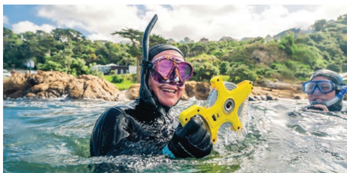
Kelper monitoring underway