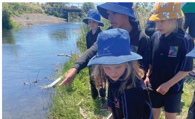
Featherston School students explore in Wairarapa Moana

Our work is supported through our partnership with the national Mountains to Sea Conservation Trust. We are the sole regional providers of its unique programmes in Te Upoko o te Ika a Māui.