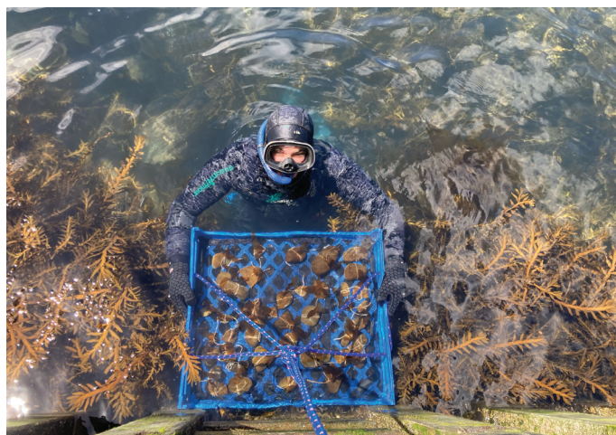
The first plant-outs at Worser Bay, September 2023

The ever-popular Explore programmes continue. More than 2000 students have been knee-deep, elbow-deep (and sometimes even deeper) in our harbours, rivers and coastline in the past year through our education programmes, and over 500 people dived into their local marine reserves during our free community snorkel days.