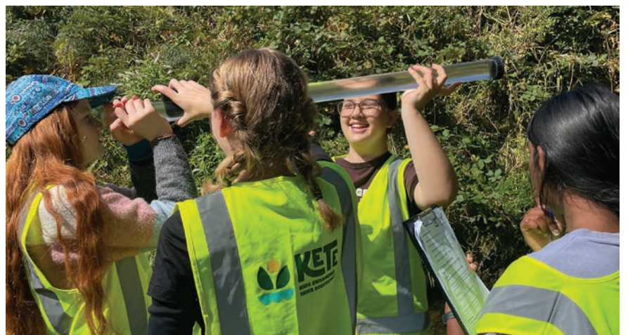
Water monitoring as part of the KETE project in Porirua

Our incredible new Wai Connection team is making waves. With their expertise and passion, they've strengthened our ability to drive positive change and to have an even bigger impact across Te Upoko o te Ika a Māui. The team have hosted 30 community events and 31 action-packed workshops, helping to develop and deliver 13 research and restoration plans. They rolled up their sleeves to help plant 1,630 native seedlings. It's been a year of teamwork, growth, and plenty of muddy gumboots.