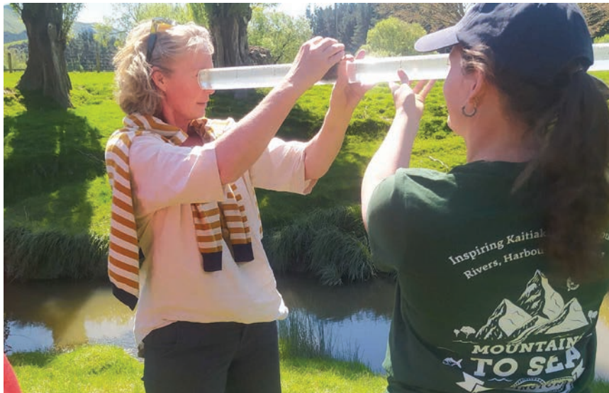
Water quality testing for Wai Connection