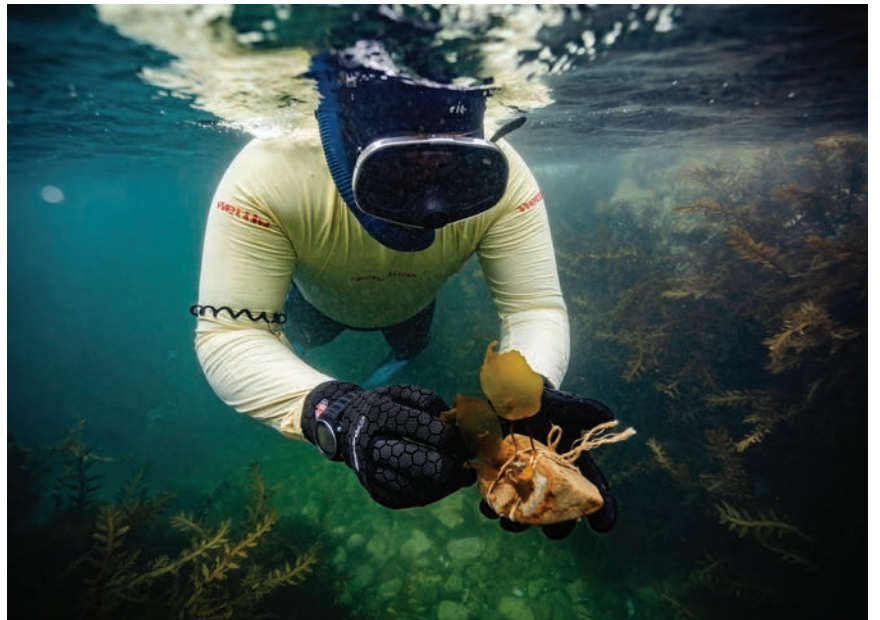
Giant Kelp Plant outs at Worser Bay

Our seaweed restoration team has been busy out and about the coasts of Wellington, learning about, and developing techniques for the restoration of our giant kelps. This past year, 384 seaweeds were planted out using 'green gravel' (seaweed-inoculated rocks). In April, we expanded the Kura Kelper group with 8 new students trained and certified in seaweed planting and monitoring. We even hosted a Seaweed Immersion day for others working in restoration across Aotearoa.