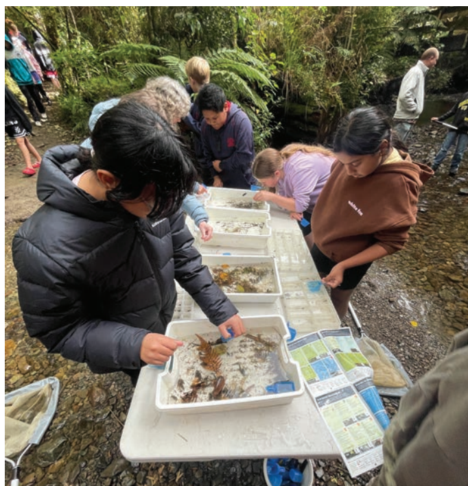
Fergusson Intermediate at Tunnel Gully