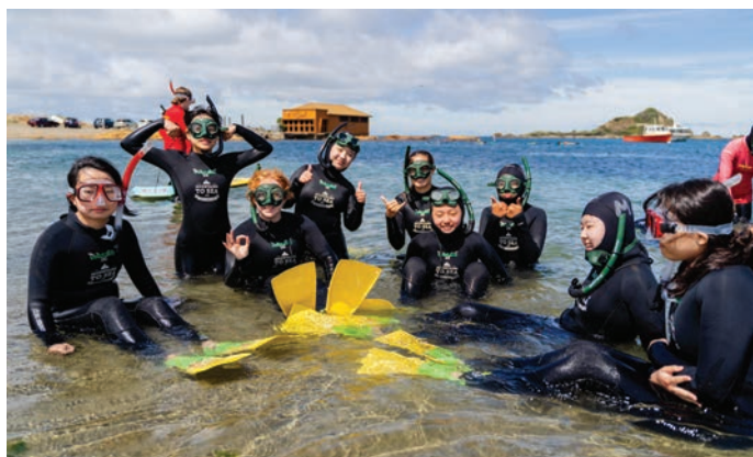
Community Snorkel at Taputeranga Marine Reserve

Thank you for your support this year, for being inspirations in your own right, and for being on this journey with us - from the mountains to the sea.