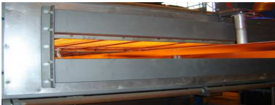
Continuous Coil Line