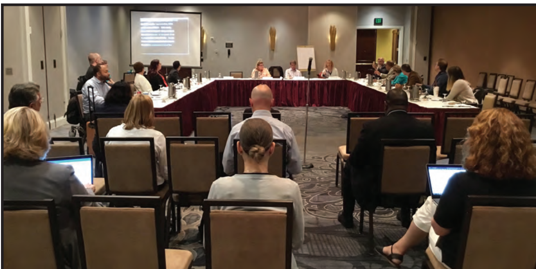
PaRC Members, OVR Staff, & Guests during a Full Council Meeting

Perform other functions consistent with VR services deemed appropriate by the Council.