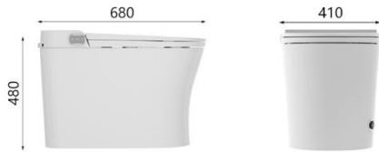
Ceramic socket size