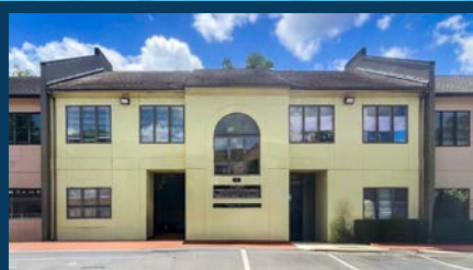
1 CARRIAGE LN, BLDG B CHARLESTON, SC 29407