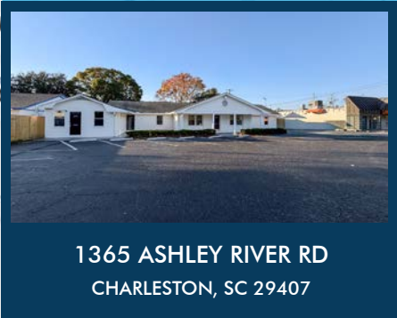
1365 ASHLEY RIVER RD CHARLESTON, SC 29407