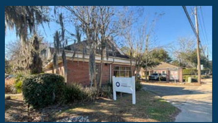
1321 ASHLEY RIVER RD CHARLESTON, SC 29407