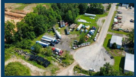
124 BOMBAY DR COLUMBIA, SC 29209