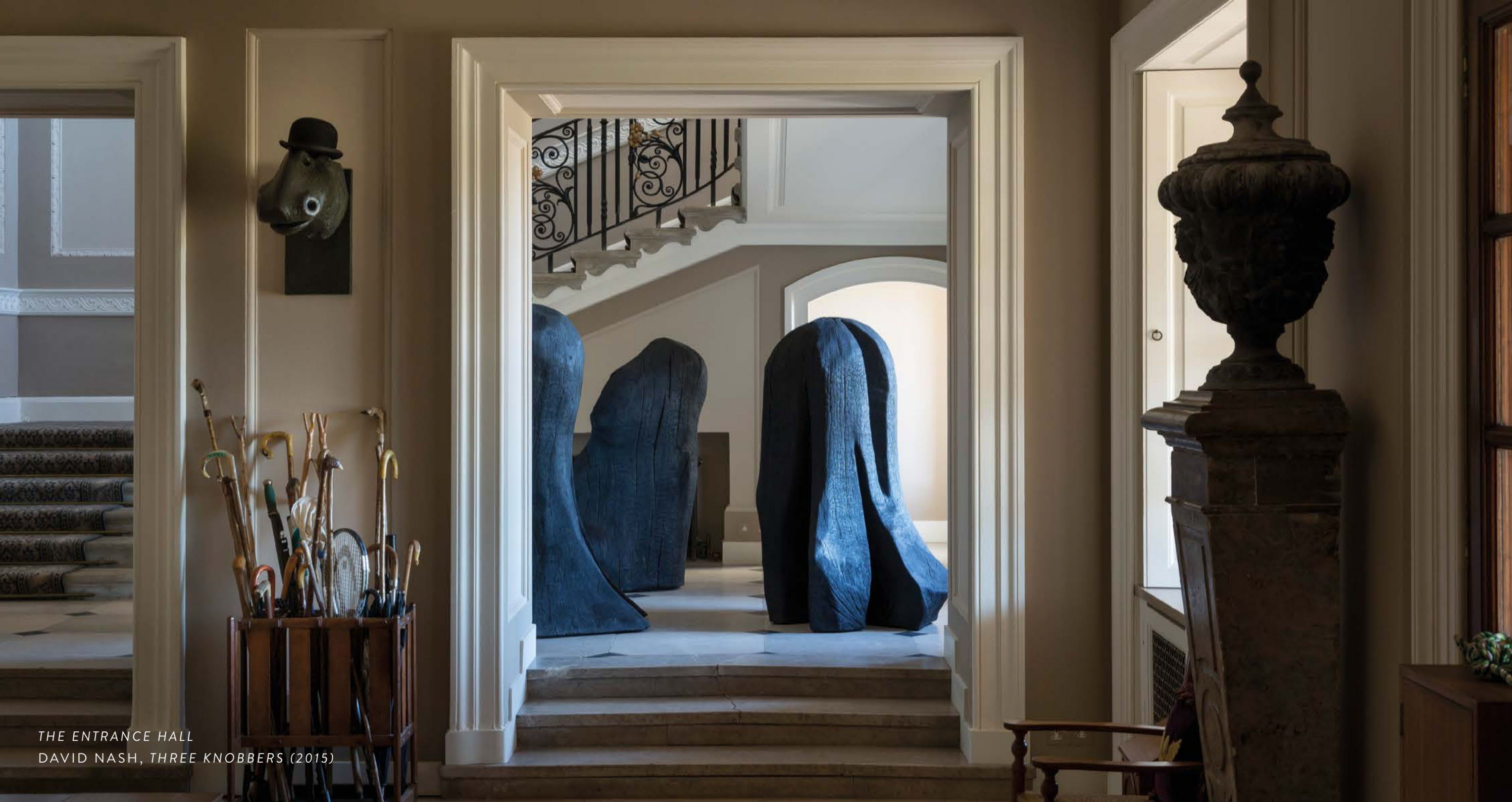
THE ENTRANCE HALL DAVID NASH, THREE KNOBBERS (2015)