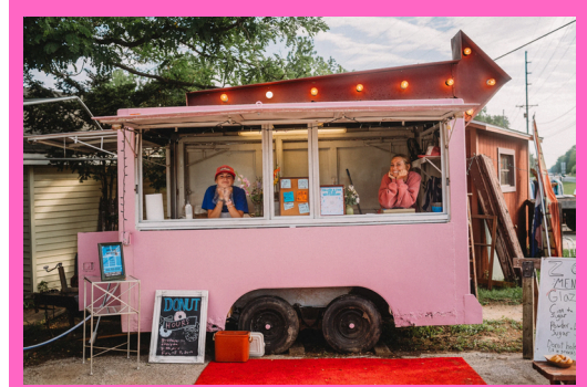
First Location 12816 Red Arrow Hwy, Sawyer, MI.

anyone could be a part of. In my first season, 2023, I sold 15,000 donuts and was able to purchase a mobile food truck for my business. This purchase allowed me to start a second location and offer private events. In my second season, 2024, I added another location by operating out of the stationary food truck at 200 W Buffalo St. in New Buffalo Michigan, operated for six weeks, and hired seven employees. I am currently the sole proprietor of Zo's Mini Donuts and I want to continue to spread the sweetness.