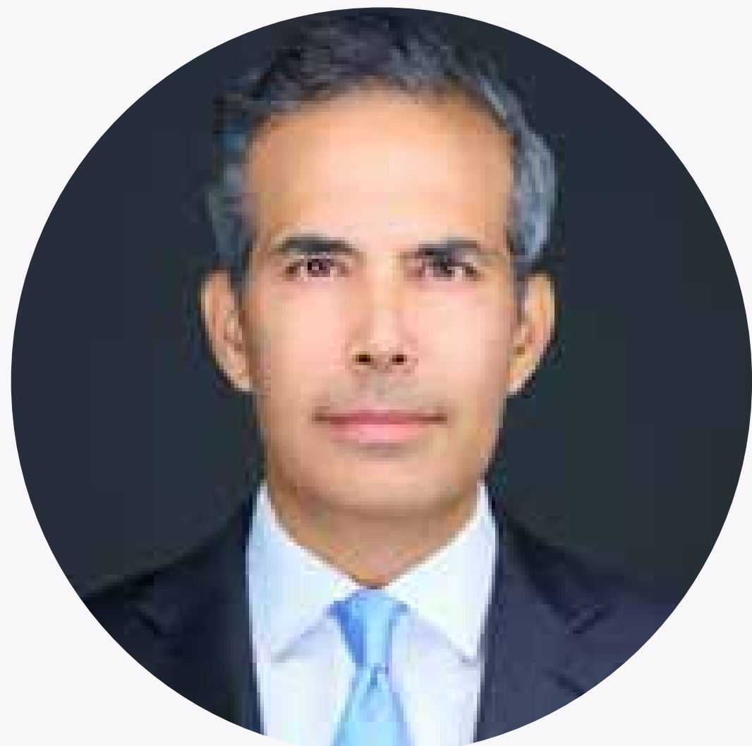
George P. Bush Advisor