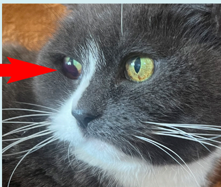
Paddy's eye after 4 days of treatment

If your cat is over 7, talk to us about a blood pressure check—it's a simple step that can make a big difference.