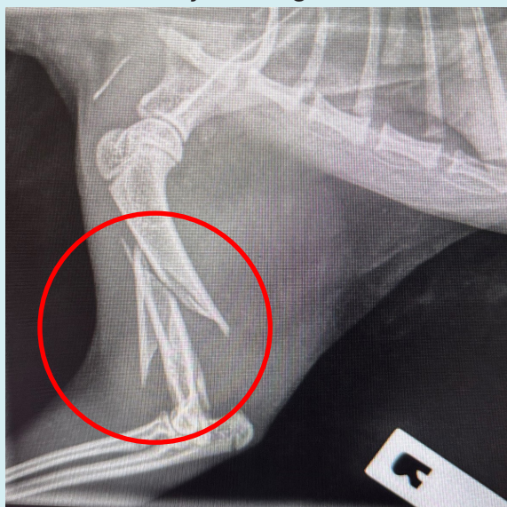
X-Ray showing break