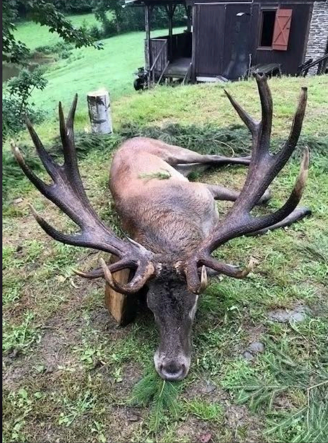
RED STAG GOLD MEDAL TROPHY 254,00 CIC Points. 15,1 KG