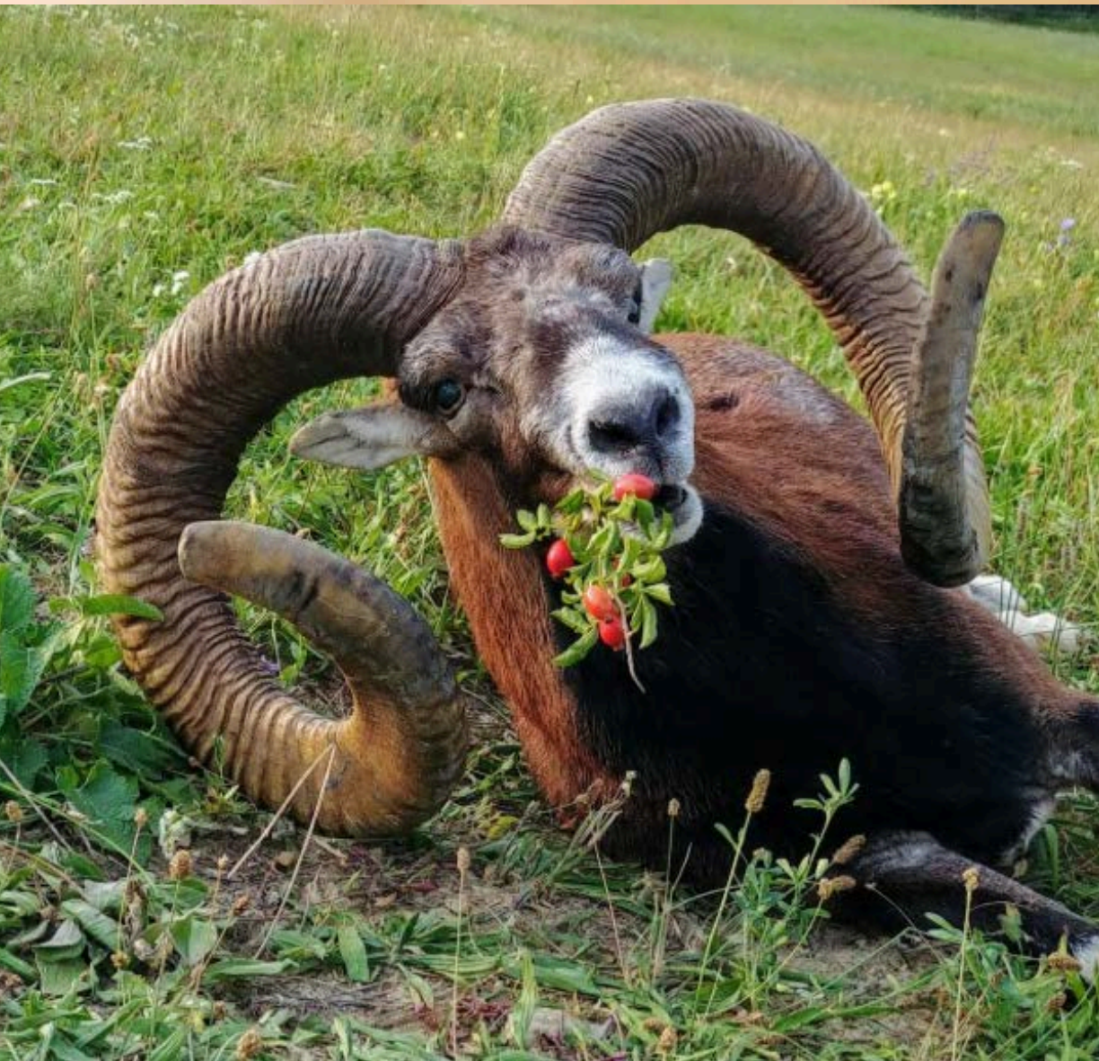
Mouflon ram gold medal trophy 242,30 CIC Points