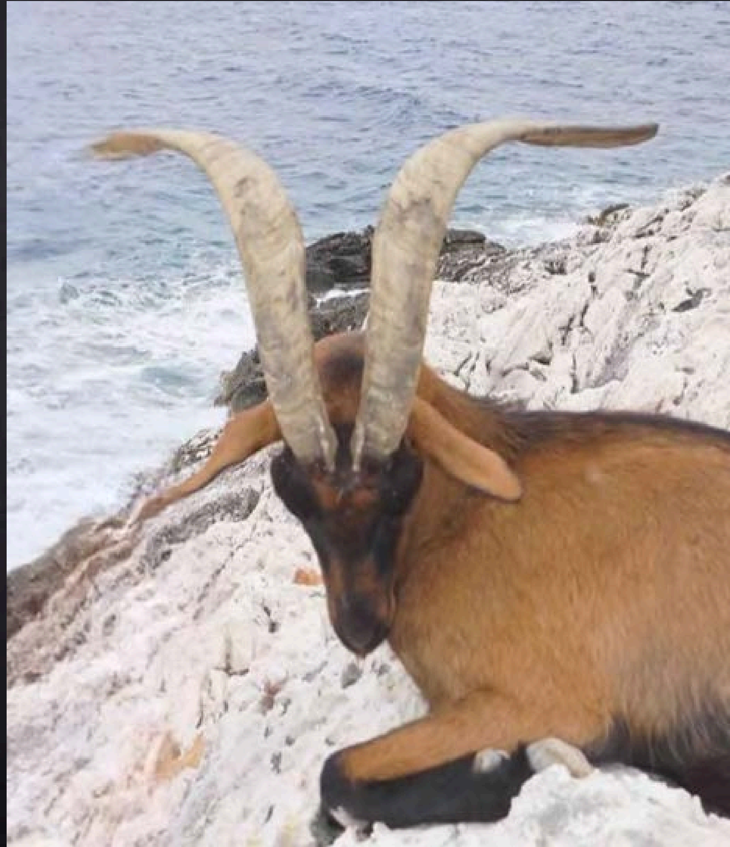
KRI KRI HYBRID IBEX HUNTED IN CROATIA