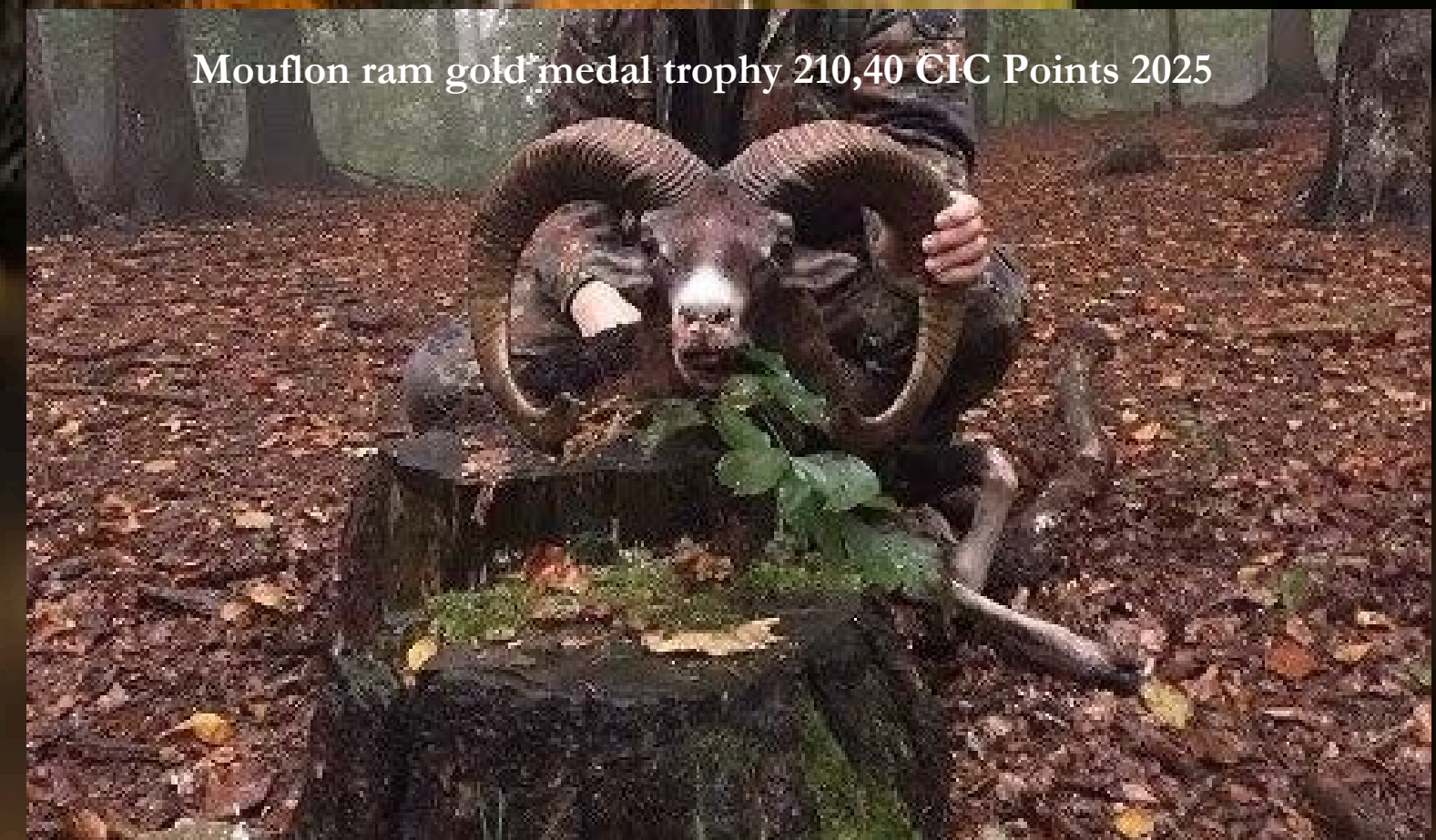
Mouflon ram gold medal trophy 210,40 CIC Points 2025