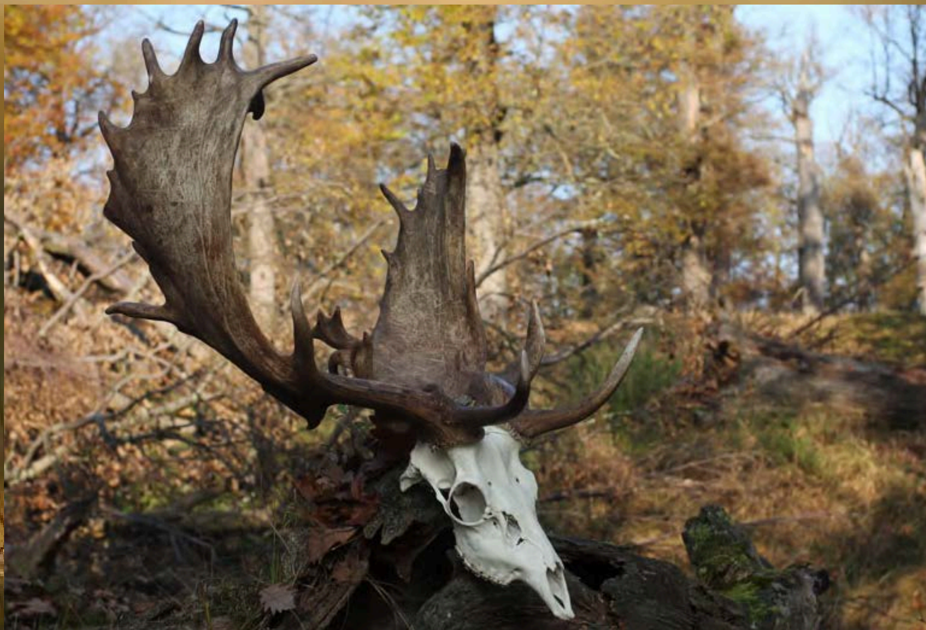
FALLOW BUCK WITH GOLD MEDAL TROPHY 222,20 CIC Points