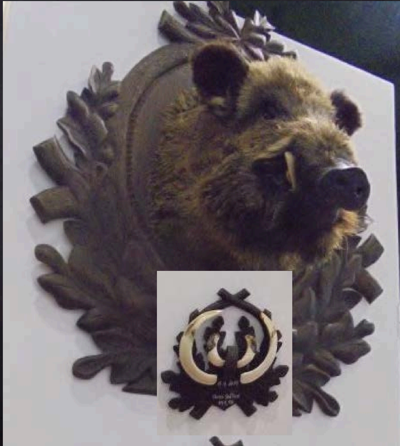
TROPHY 149,00 CIC POINTS