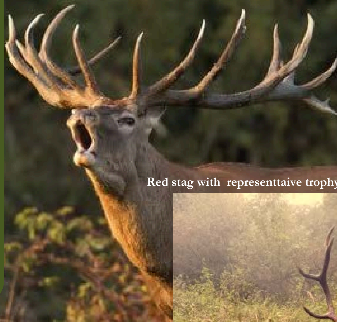
Red stag with representative trophy 164,88 CIC – 7 years old hunted in 2025

Other games as Japanese sika stag, mouflon ram, fallow buck, wild boars: prices on request