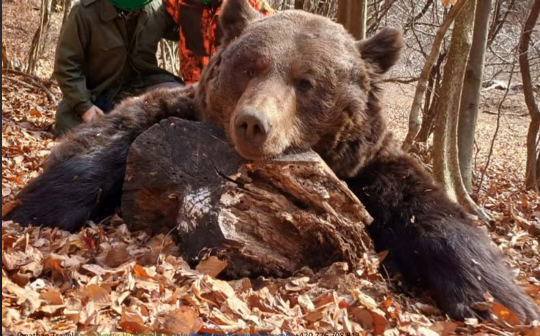
BROWN BEAR HUNTED IN ROMANIA