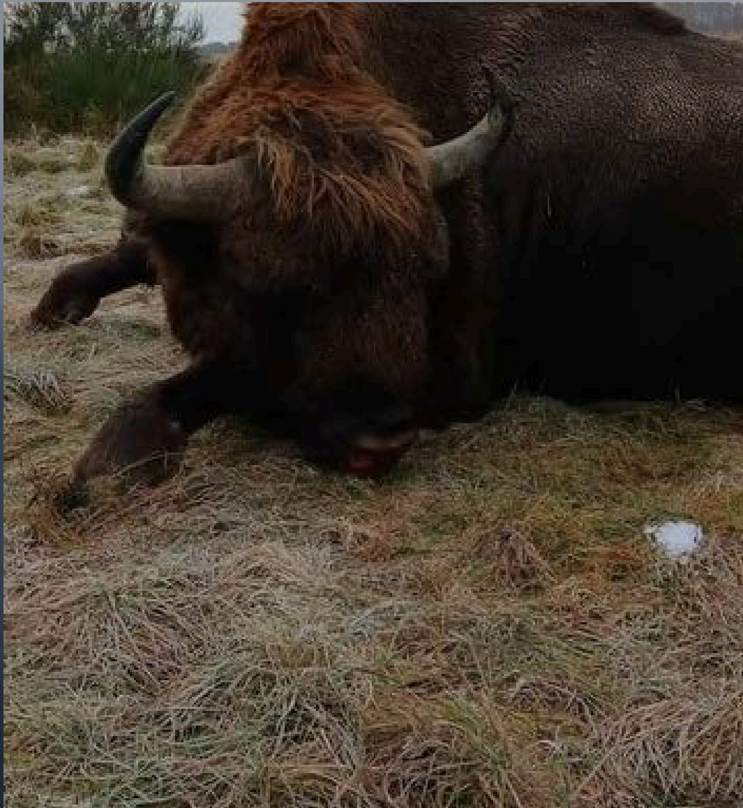
European bison with gold medal trophy 205,00 CIC Points