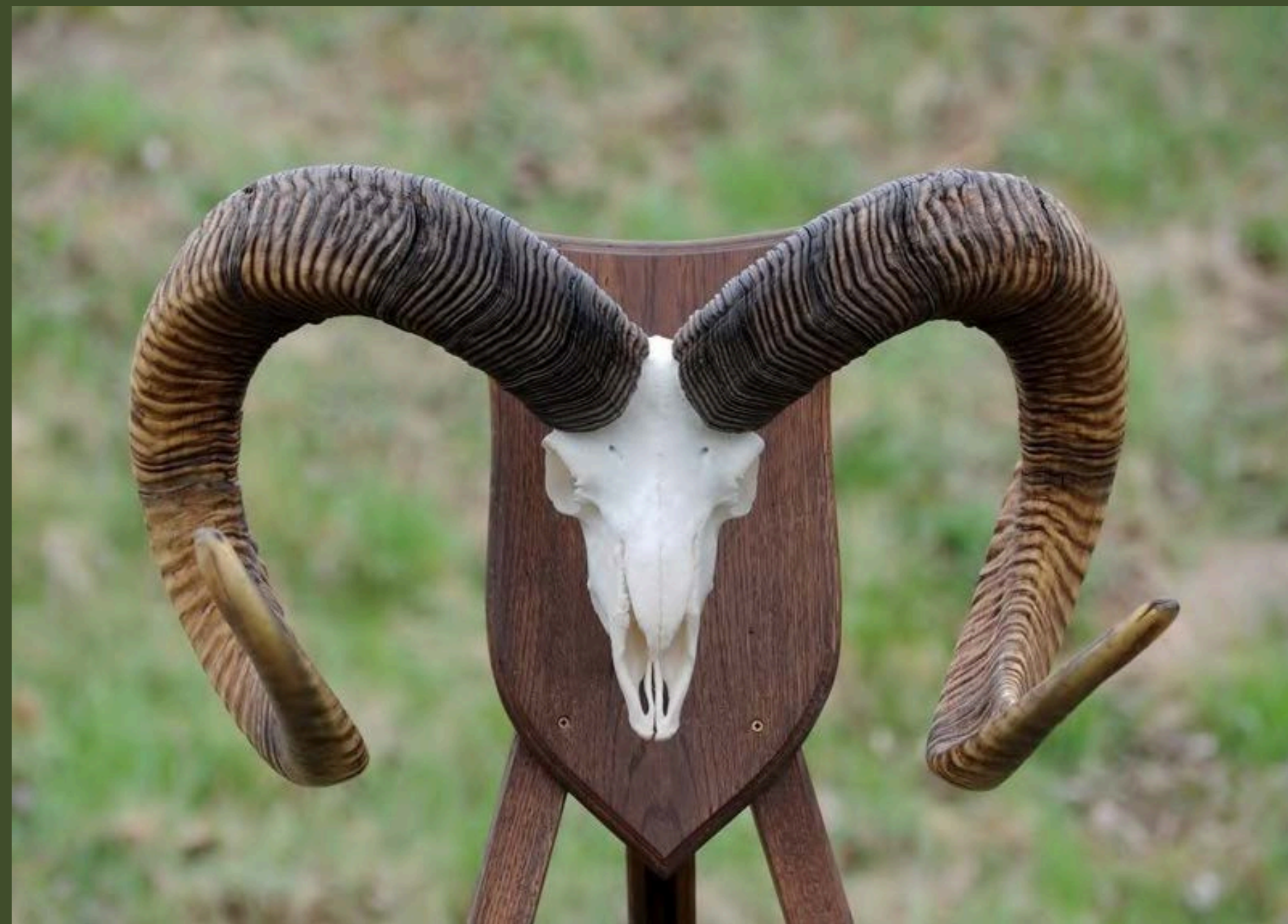
MOUFLON RAM TROPHY 258,60 CIC POINTS – 112 CM