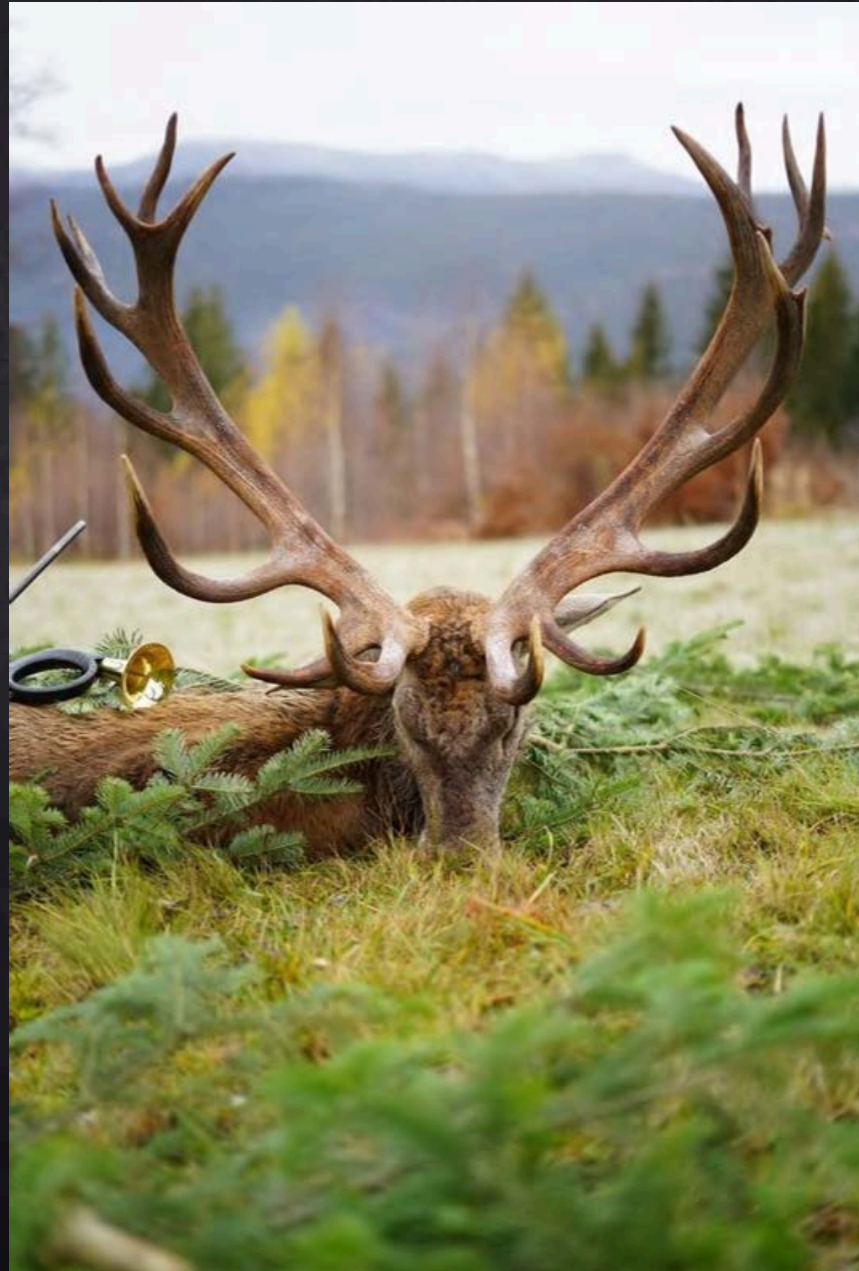
RECORD RED STAG TROPHY 253,28 CIC POINTS FREE RANGE IN SLOVAKIA