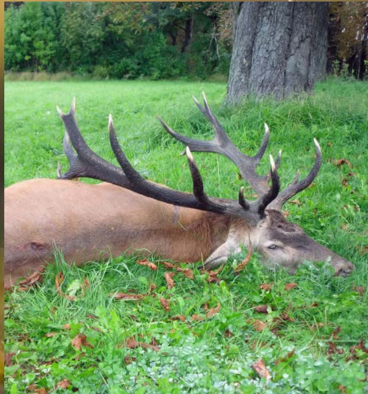
Red stag gold medal trophy 224,50 CIC Points