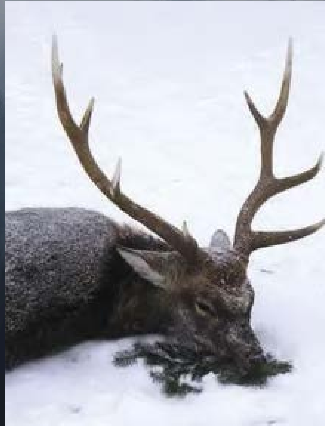
Japanes sika stag with strong gold medal trophy 328,20 CIC Points