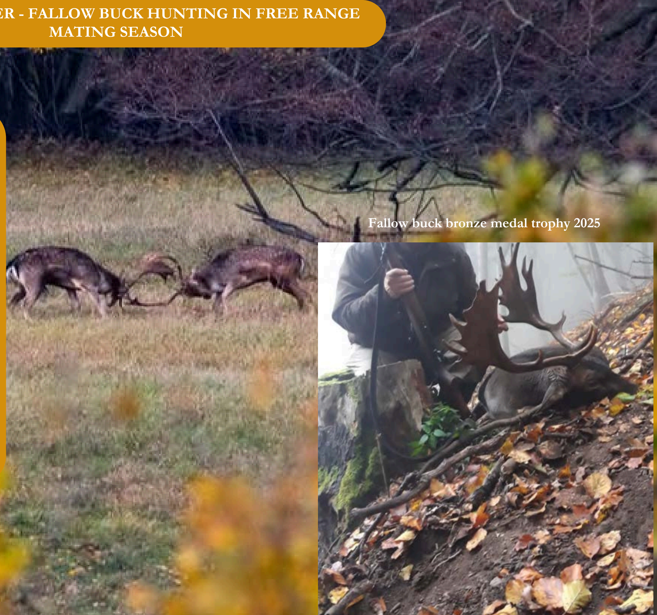
Fallow buck bronze medal trophy 2025