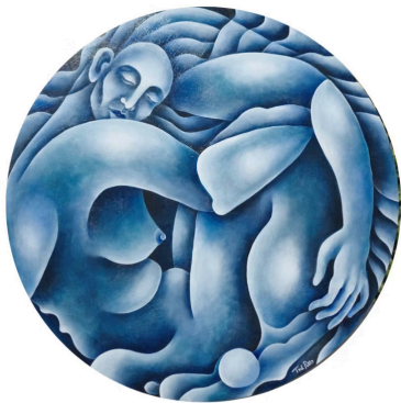
Meditations IV (rotating artwork)