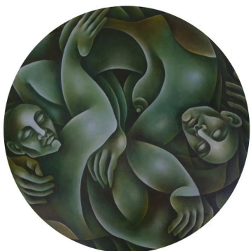
Meditations I (rotating artwork)