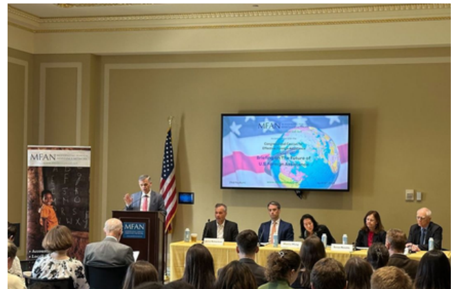
MFAN Hosts Congressional Staff Briefing - April 15