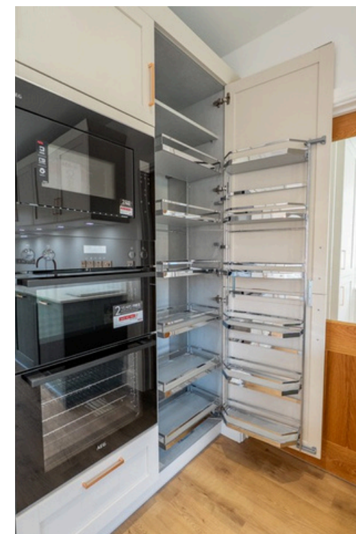
Selected AEG Appliance