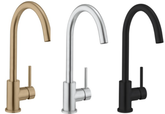
STANDARD Crosswater tap

Hot, cold and 100°C boiling water from one stylish tap. (Available as an optional buyer upgrade.)