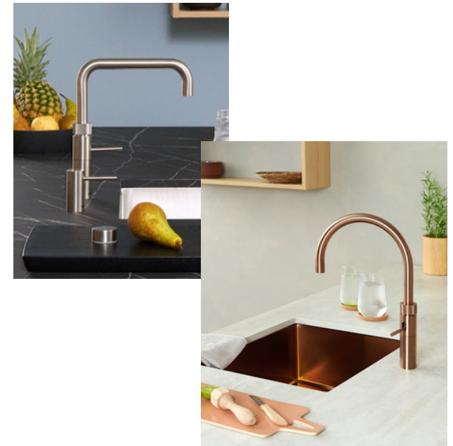
UPGRADE Quooker tap