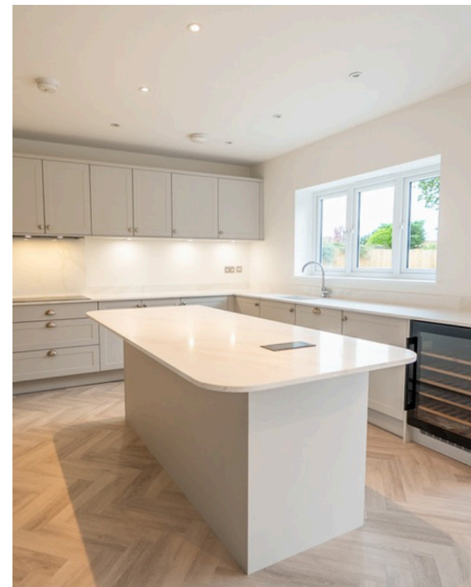
Featured kitchen: Harvard.