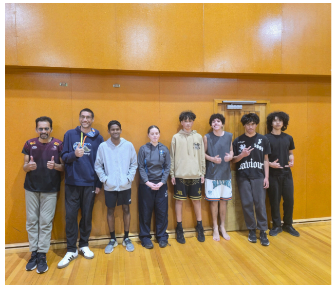
We couldn't let the netball teams take all the glory! Sonrise Saints, volleyball winter social grade winners.