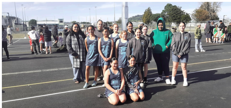
Ngā Uri Poutama, undefeated C Grade winners.

To provide Christ-centered education to prepare children for life both temporal and eternal.