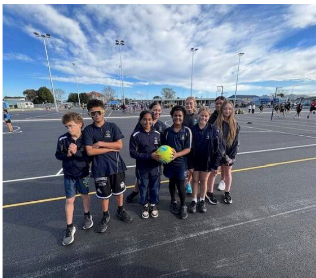
Mataora tamariki smashed it First equal at the Fast 5 tournament.