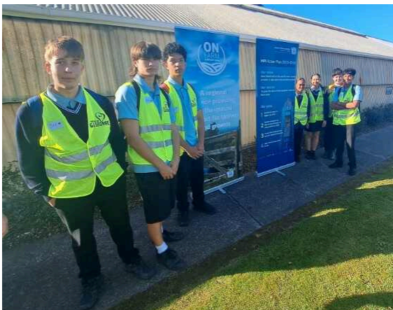
Te Ara o Poutama's visit to the horticulture centre in Stout Street.