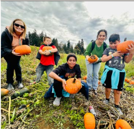
Elementary School Pumpkin Patch