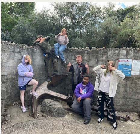
High School Pacific Science Center