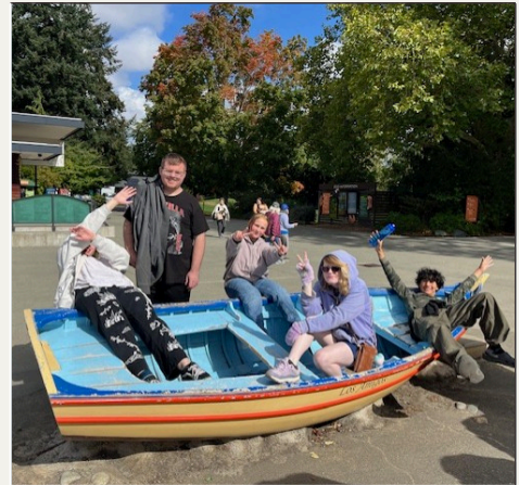
High School Park Adventures