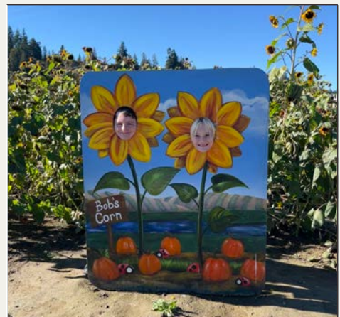
Middle School Pumpkin Patch