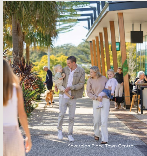
Sovereign Place Town Centre