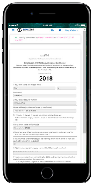
Mobile UI Smart Onboarding Audits

Smart Onboarding has helped millions of people successfully join their organization