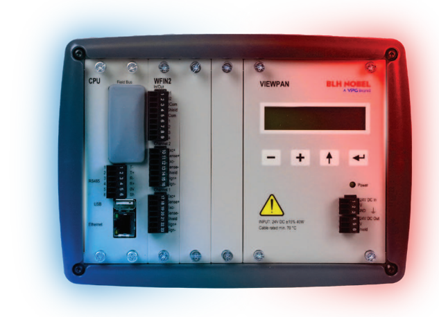
DIN-Rail Mount Unit

G6-RM instruments accommodate up to three different, easily installed, modules for advanced performance, more functional channels, custom applications, or repair. This provides customers with a highly flexible, upgradeable, single instrument system capable of weighing up to six independent vessels or