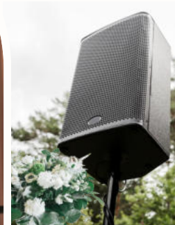
MICROPHONES & SPEAKER $300

A MUST HAVE TO SHARE YOUR PHOTO MONTAGES, VIDEOS & SPECIAL COMPILATIONS!