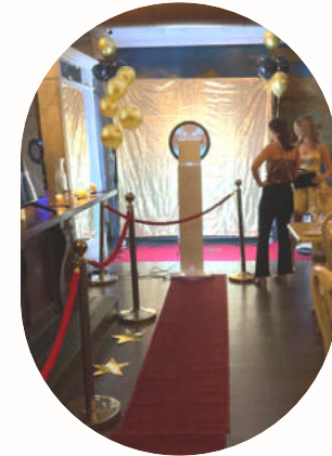
PLATINUM PACKAGE $1,000