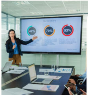
PROJECTOR & SCREEN $300