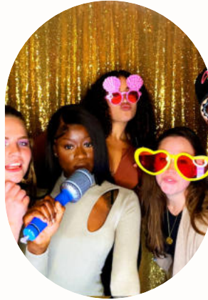
GOLD PACKAGE $750