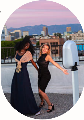
SILVER PACKAGE $500