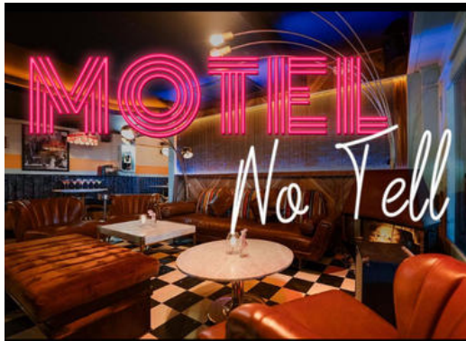
MOTEL NO TELL

Book one of our preferred venues and add on any of our services to receive a 10% discount on the service!*