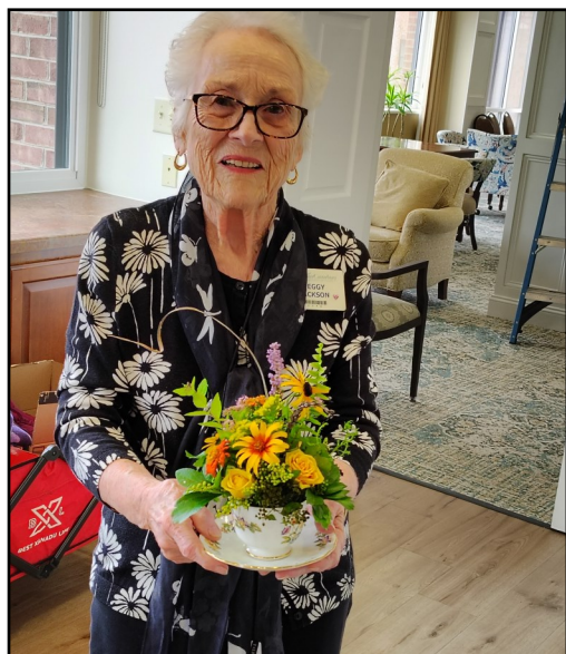
Creating Teacup Floral Arrangements