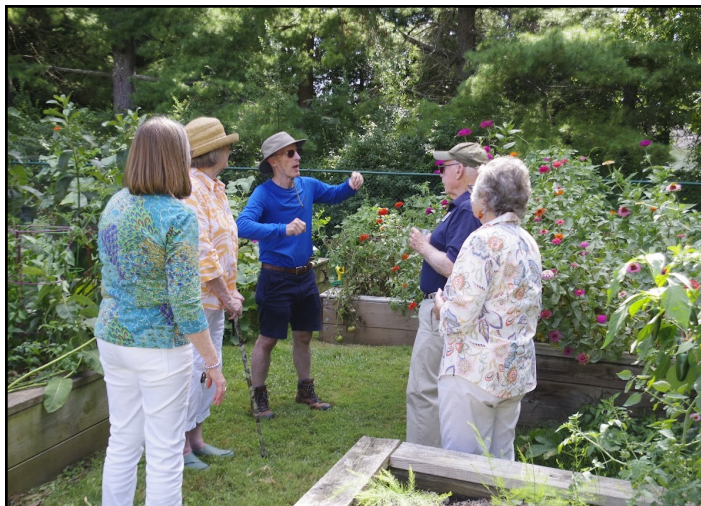
G a r d e n P a r t y