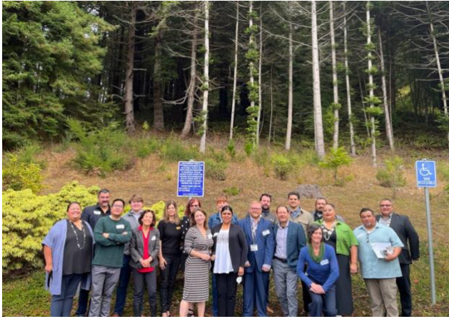
Diverse community leaders find common ground regarding a controversial wind project in Tribal Lands.

ops, and other coalitions and entities that are spurring locally-led innovation, shared problem solving, and building civic trust.