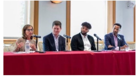
Speakers at the Connecticut Service Symposium, May 2024