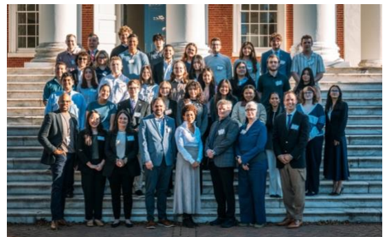
Leaders and participants of Declaration Next, a civic learning initiative co-led by Monticello, Karsh Institute of Democracy, and More Perfect gather on the steps of the University of Virginia's Rotunda

College Presidents for Civic Preparedness , a network sponsored by the Institute for Citizens and Scholars , now has 126 members who are working together to learn how to strengthen civics in higher education. Alliance for Civics in the Academy , founded by the Hoover Institution in 2024, has 200 members who are sharing syllabi and developing a strategic vision for improving civic learning on our higher education campuses. AAC&U , Campus Compact , Karsh Institute of Democracy , and More Perfect are developing the Higher EdX Initiative to identify innovative approaches to expanding civic education and engagement across college campuses that are scalable, including in public, private, independent, community, historically Black, Hispanic-serving, and Tribal colleges.