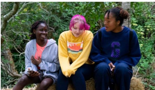
American Exchange Project participants

The American Exchange Project (AEP) is a first-of-its-kind domestic exchange program that sends high school seniors on a free, two-week exchange experience to an American town that is radically different from their own, and helps them host peers from across the country in their