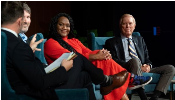
Speakers at Trust, News, and Democracy, hosted by the LBJ Foundation and More Perfect, April 2024

Action-Prompting Events: On April 9 & April 10 , 2024, the LBJ Foundation, More Perfect,