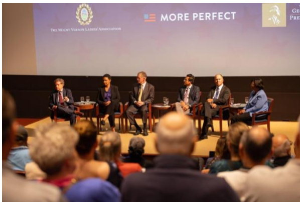
Mount Vernon Summit, September 2024

Presidential Centers Collaboration: Leaders from many Presidential Centers within the More Perfect alliance have played an active role in envisioning and advancing the democracy goals and initiatives connected to the 250 th anniversary of the country's birth. Given that momentum, at the More Perfect summit at George Washington's Presidential Center at Mount Vernon in September 2024, Presidential Center leaders and other civic and history-centered