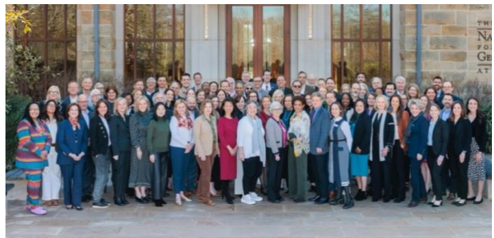
Attendees of the Mount Vernon Summit, February 2025

More Perfect & Mount Vernon Summit catalyzes $3M in new investments in bridging. In February 2025, More Perfect, George Washington's Mount Vernon, Boeing Foundation, and the Annenberg Foundation at Sunnylands, co-hosted a convening at Mount Vernon bringing together the Co-Chairs of all of the Democracy Goals and civic, philanthropic, government, and business partners to discuss and pressure test updated strategies and targets to advance the Goals and identify what can be achieved with appropriate investment by the 250th.