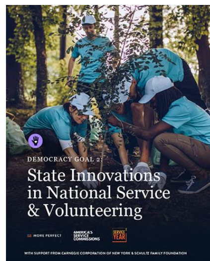
State Innovations in National Service & Volunteering Report

Also in 2024, More Perfect developed and launched – with National Governors Association Chair Governor Spencer Cox – Service Year Fellowships across the State of Utah, which marks the first adoption of a leading recommendation of the National Commission on Military, National, and Public Service and a key provision in the Edward M. Kennedy Serve America Law. The early results of One Utah Service Fellowship showcase the extraordinary progress that can be made across a State to expand national service opportunities and place talent into nonprofit and other community-based organizations in need of support.