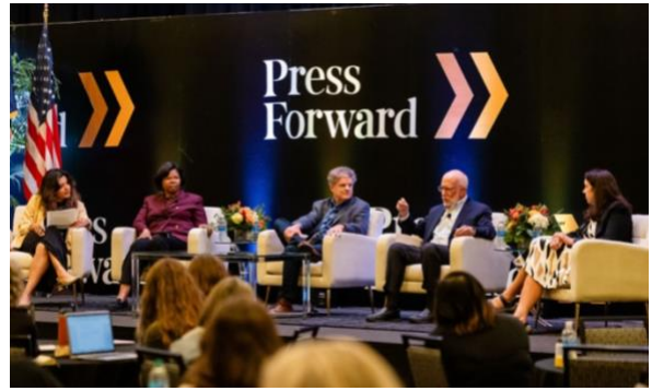
More Perfect presents progress and challenge on the five Democracy Goals and various 250 th initiatives at the Plenary Closing Panel of the Press Forward Conference in Charlotte, NC, October 2025

With this momentum, the George W. Bush Institute, More Perfect, Press Forward, and the American Journalism Project are partnering on a summit with the Texas Tribune, Fort Worth Report, and philanthropic leaders across Texas on December 16, 2025, to identify gaps and prompt investments in sustainable local news outlets. More Perfect and the same Democracy Goal 5 partners are working with the John F. Kennedy Presidential Library Foundation to revitalize local news in Massachusetts with a gathering of philanthropic leaders in 2026. More Perfect also partnered with the Karsh Institute of Democracy at the University of Virginia to support a Local News Ecosystem Study of gaps and opportunities in local news in Virginia, as work continues to form a Press Forward chapter in the Commonwealth.