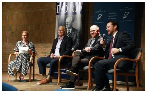
Speakers at Principles for Trusted Elections, September 2024

More Perfect released in early November 2024 a Joint Statement on Trust in Elections as a Cornerstone of American Democracy that more than 100 former U.S. Senators, Members of Congress, Governors, White House officials from both parties, and top-ranking military veterans signed to affirm the critical importance of trust in America’s elections and the peaceful transfer of power.