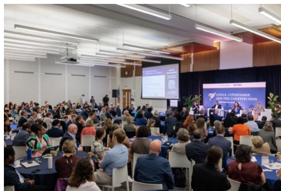
Civics, Citizenship, and the Constitution Summit, September 2025

The Summit advanced the mission of More Perfect and iCivics to catalyze a national upswing in civic energy as the nation approaches its 250th anniversary. Sponsors of the Summit included the Annenberg Foundation Trust at Sunnylands, Daniels Fund, Ibis Group, Jack Miller Center, Lumina Foundation, MacArthur Foundation, Seedlings Foundation, and Trust for the National Mall.