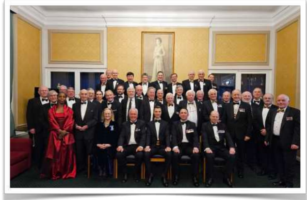
The Dinner in 2024

Further details from the Dinner Chairman Lt