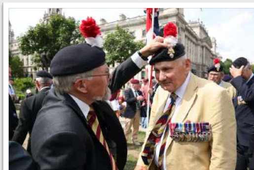
Regt Sec's beret and hackle is straightened up by his brother...

Over 150 members of Rolling Thunder , the veterans Motorcycle Club, also rode around Parliament Square, making a considerable noise and making their presence felt.