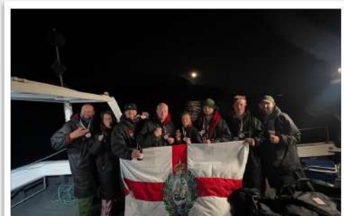
Success at the end...