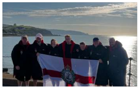
At the start...

courage, commitment, grit and determination by all swimmers, who completed this challenge to raise funds for the Fusilier Aid Society