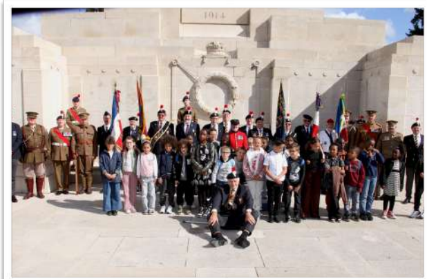
In front of the La Ferte sous Jouarre Memorial, together with schoolchildren who always attend to thank our former comrades coming to the aid of France in 1914