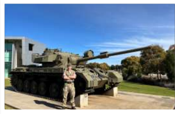
In front of the 'Atomic Tank'