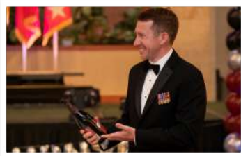
Off duty, Hawaii style...