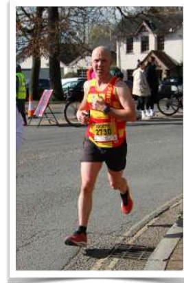
Training at a competition

https://events.armybenevolentfund.org/fundraisers/josephmurray