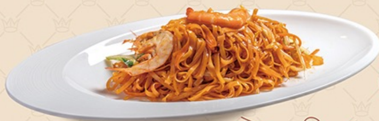
D3 泰式炒粿条 PAD THAI FRIED KWAY TEOW (PER)