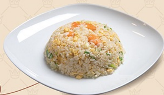
D2 虾仁炒饭 EGG FRIED RICE WITH SHRIMPS (PER)