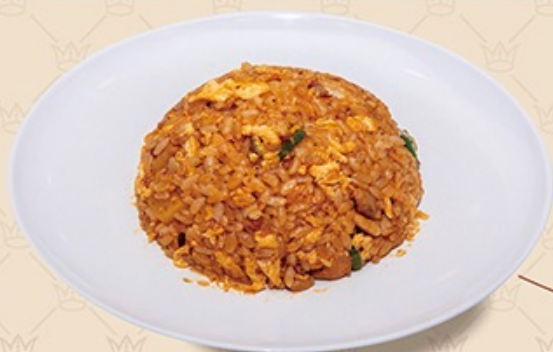
D1 香辣鸡丁炒饭 SPICY FRIED RICE (PER)