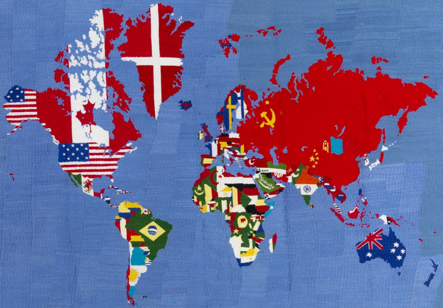
[Alighiero Boetti, Mappa , 1970-1983]