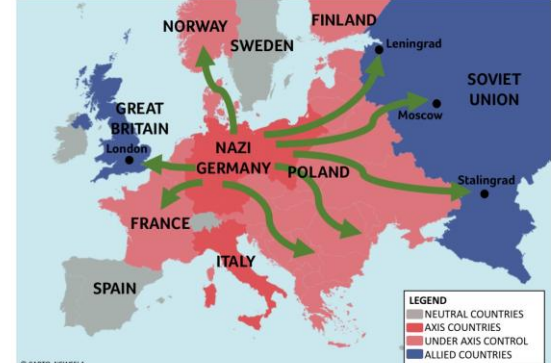
Hitler and his troops conquered much of Europe. But pushing to the East and the West at the same time proved costly.