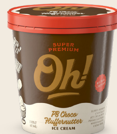
PB CHOCO FLUFFERNUTTER