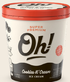
COOKIES N' CREAM