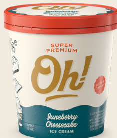
JUNE BERRY CHEESECAKE