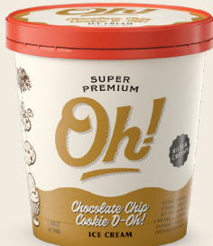
CHOCOLATE CHIP COOKIE D-OH!