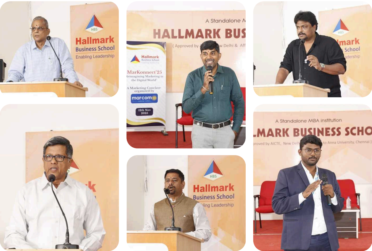
Markonnnect'25 - Marketing Conclave (Nov 2025)