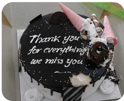
Culturals, Celebrations, Farewell, Birthdays and Various Colours of Hallmark Business School