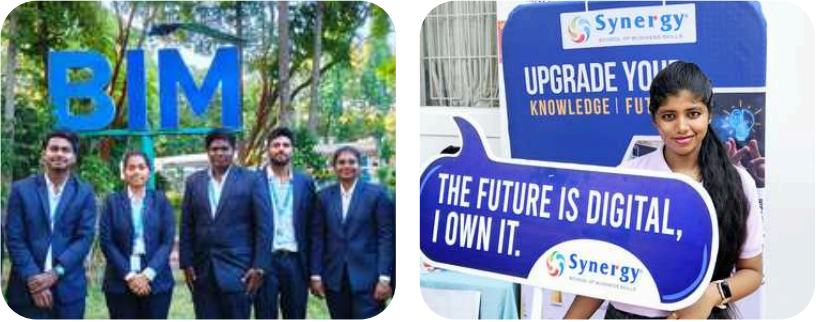
Conquest 2k25 - State-Level Intercollege Management Meet