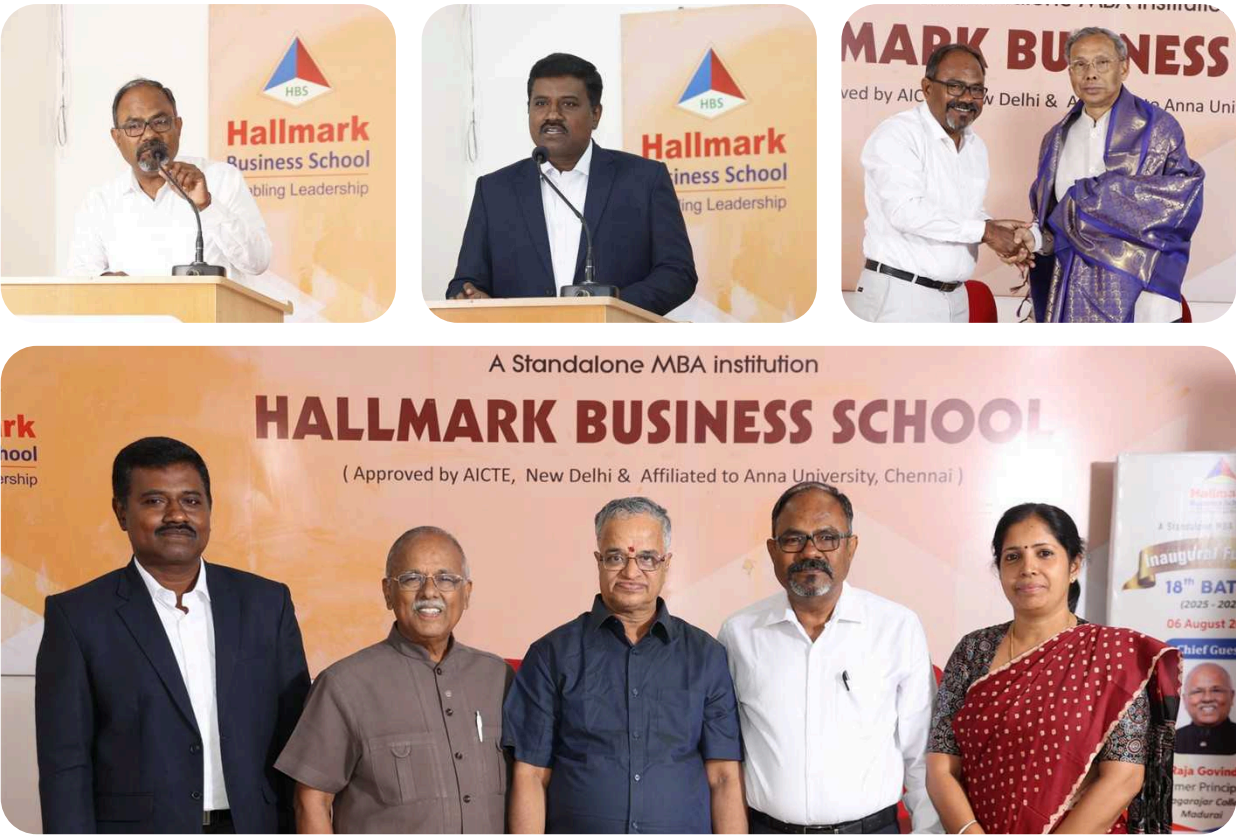
Annual Day for Batch 17 (July 2025) and Inauguration of Batch 18 (Aug 2025)