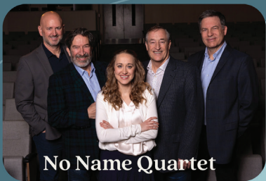
No Name Quartet