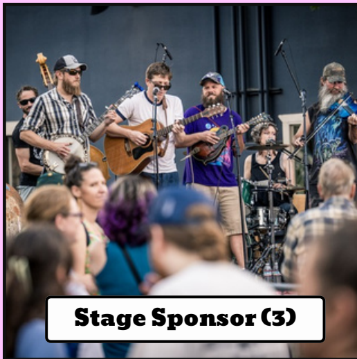
Stage Sponsor (3)