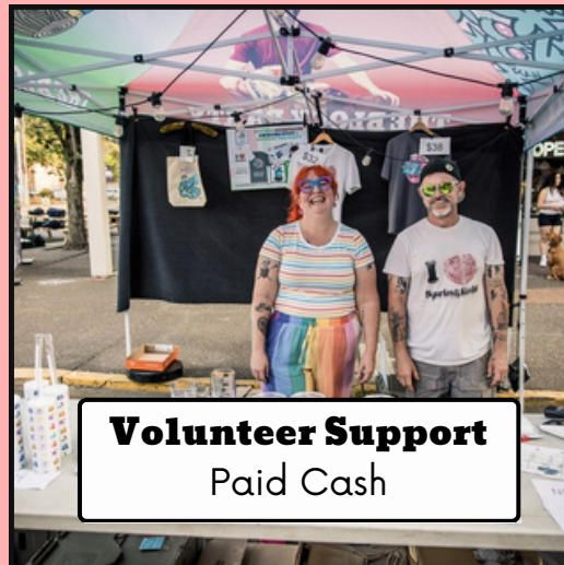
Volunteer Support Paid Cash