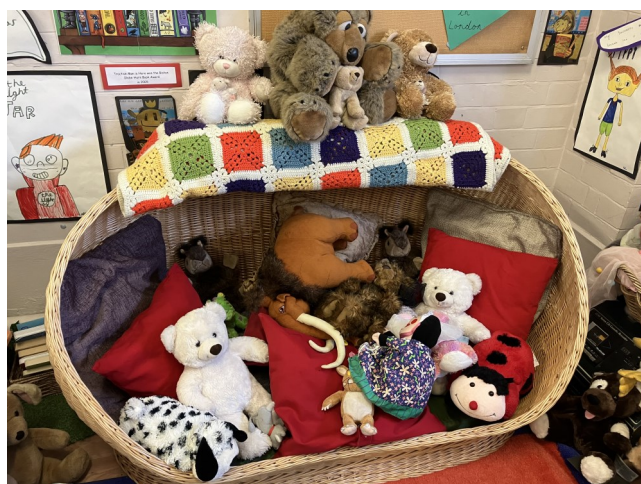
Getting comfy while reading a book.