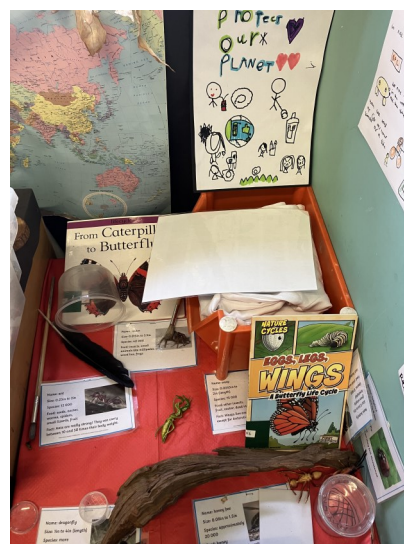
Investigating different topics.