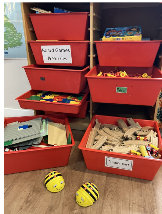
Games and puzzles