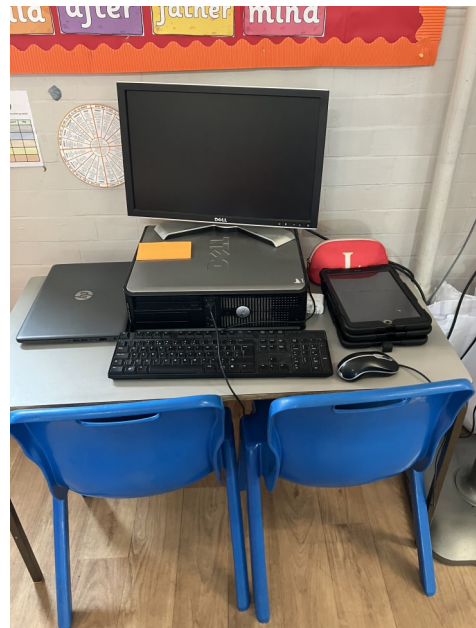
Using the computer