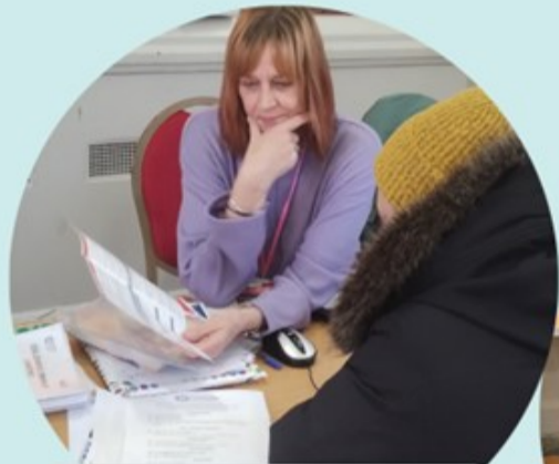
Group wellbeing activities