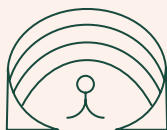
Meetings and event spaces