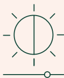
Mood-balanced lighting and sound