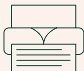
Printing and other bureau facilities