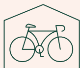
Secure bike storage