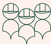
Maintenance and cleaning