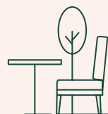
Furnished outdoor courtyard