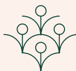
x+why app and community portal