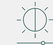
Mood-balanced lighting and sound