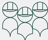
Maintenance and cleaning