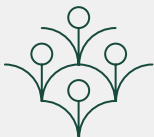
x+why app and community portal