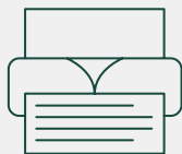
Printing and other bureau facilities