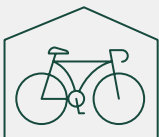
Secure bike storage