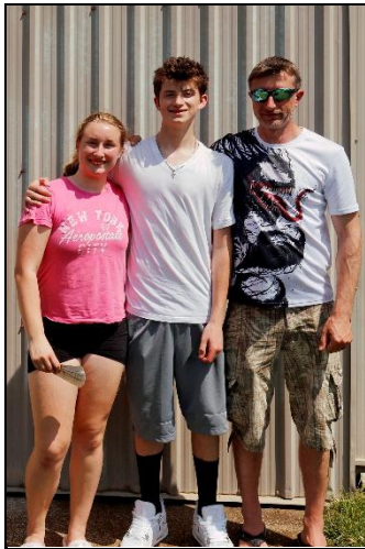
Burns Family 0.44lbs