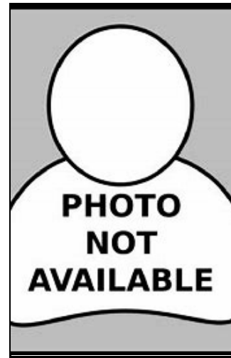
Mezzatesta Family 0.40lbs