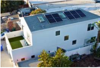
Cape May Ave