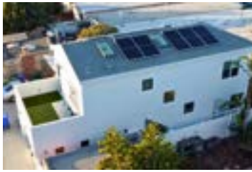
Cape May Ave