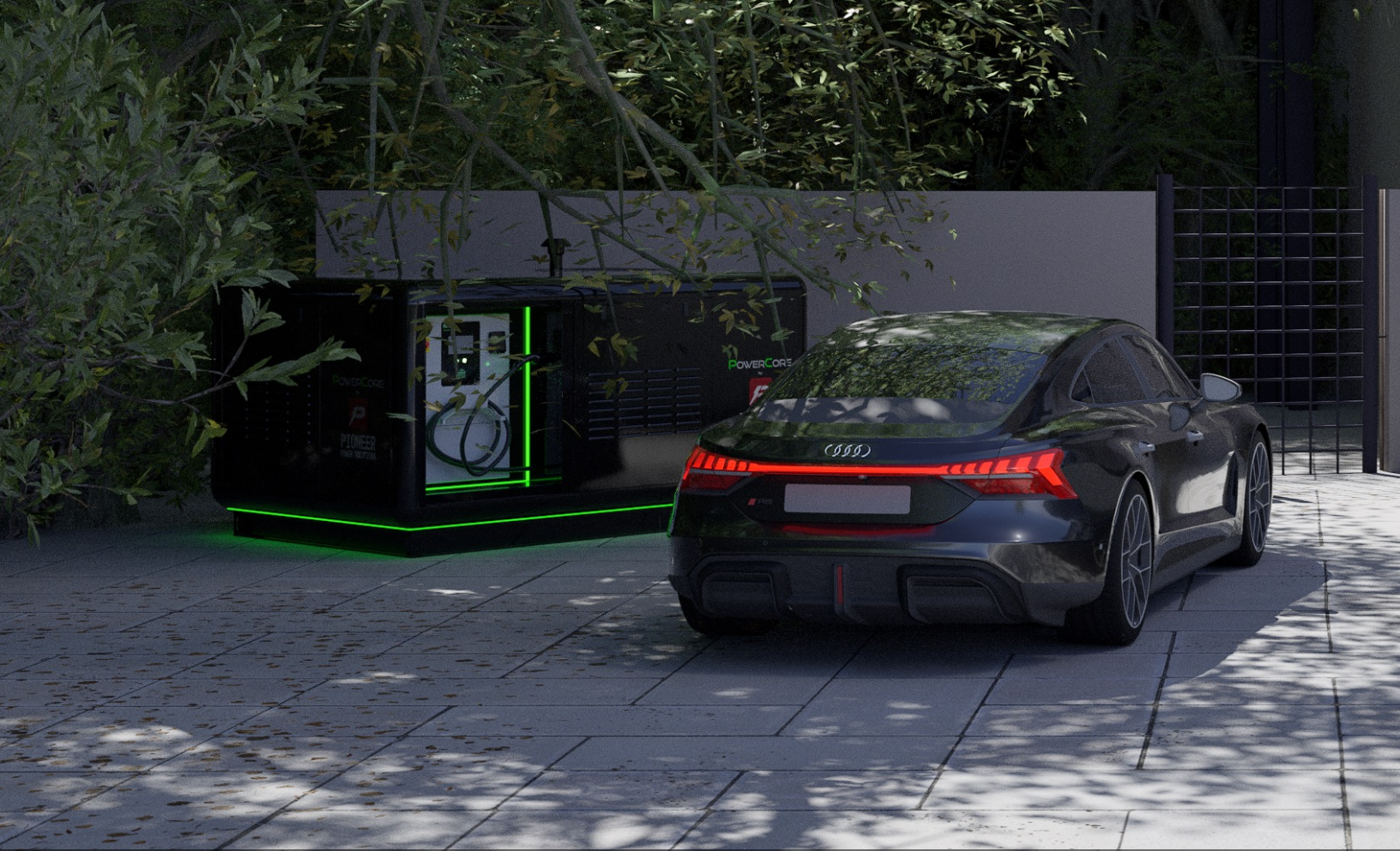
PowerCore 30kW EV Charging and Full Home Power