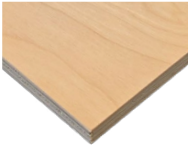
FR Birch FSC®