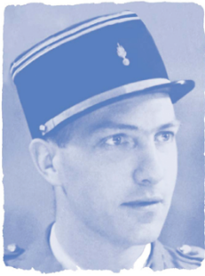
Abbé René de Naurois