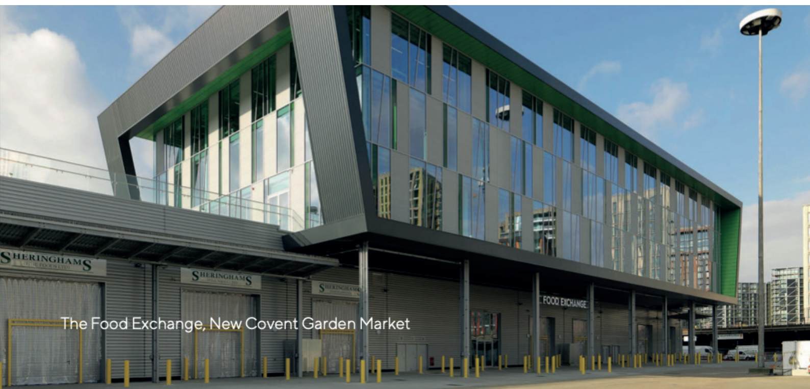
The Food Exchange, New Covent Garden Market