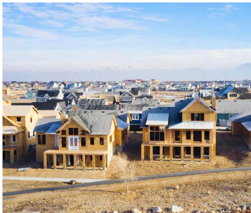
Highlands Ranch, Central Park in Denver, and Anthem in Broomfield are examples of successful metro districts.

Many metro districts are found in suburban and rural areas, where demand for new homes is high – given the availability and affordability of land.